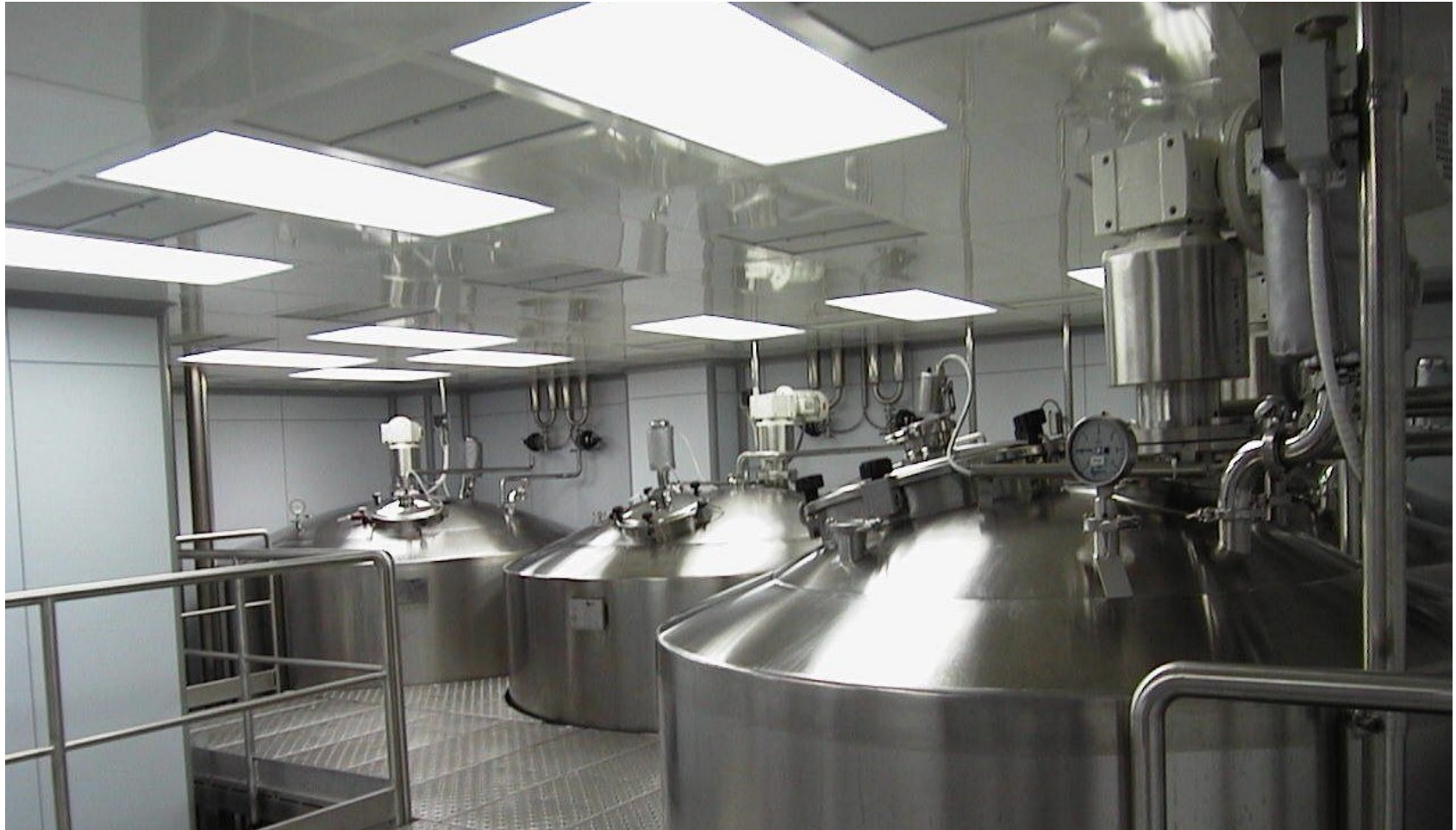
· Clean rooms