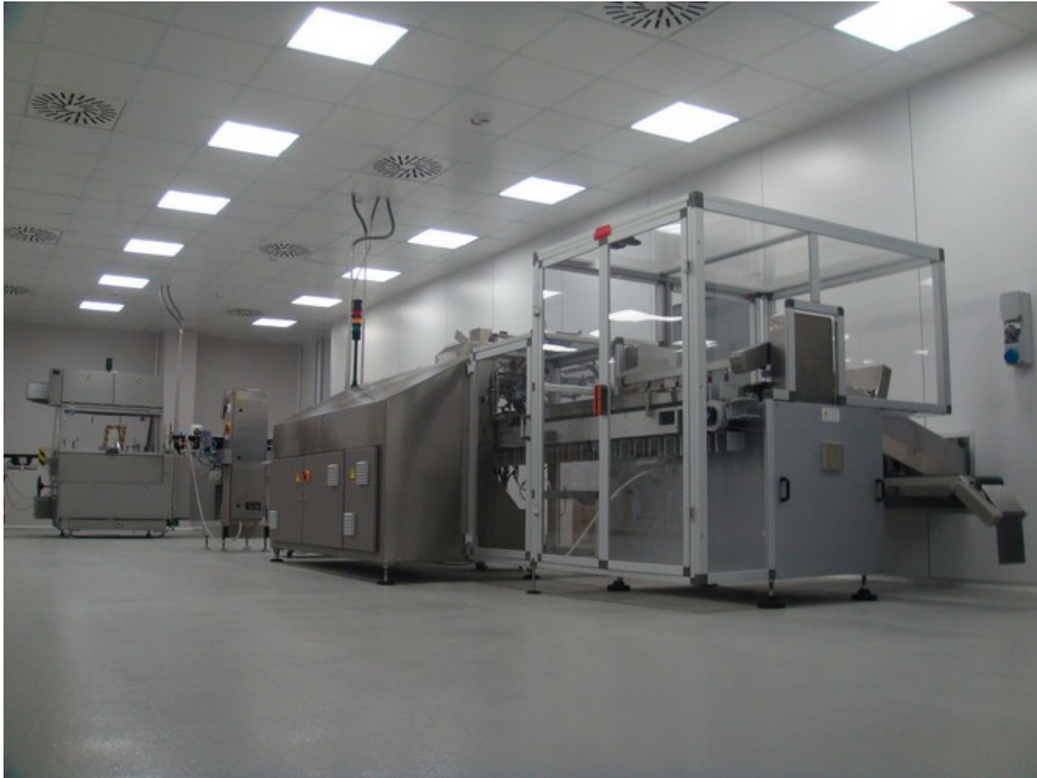
▮ Clean rooms