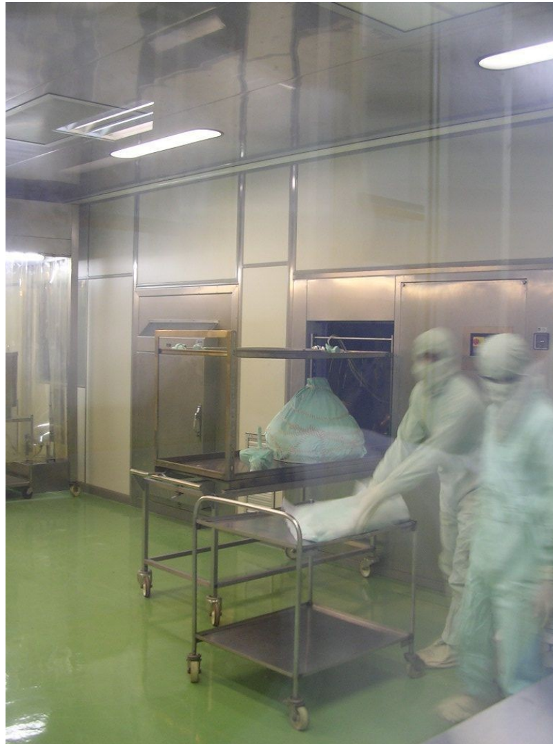
┆ Clean rooms