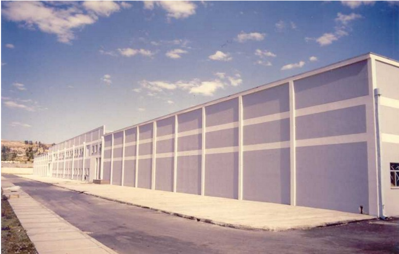
· Clean rooms